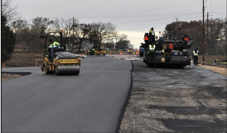
Paving operations facing north